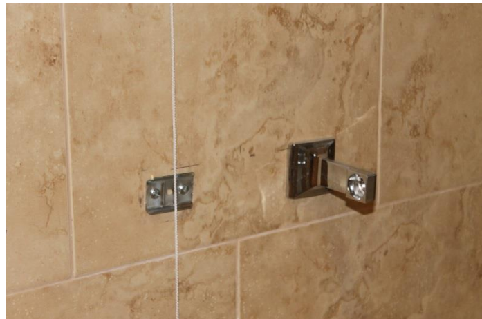
Figure 2: Grace's bathroom in Memory Care at Brentwood showing broken toilet paper holder.

Although the Brentwood fees ostensibly covered weekly housekeeping and laundry services, as well as daily tidying and bed making, her room was always cluttered and had an