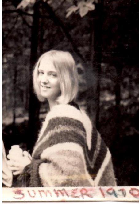
Figure 11: The author at age 19—Summer of 1970—Paulinskill Lake, Newton, NJ.